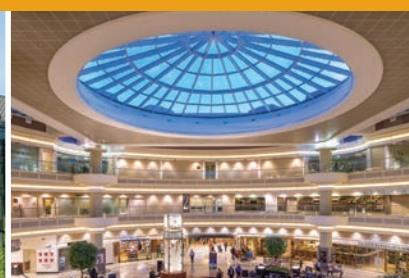
AVIATION Atlanta Airport