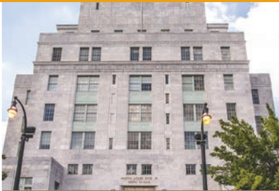
GOVERNMENT MLK Federal Building