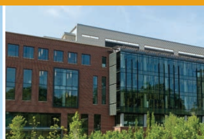
RESEARCH LABS Georgia Tech