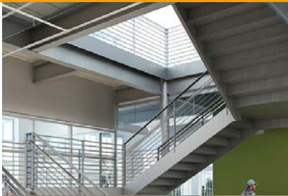
HIGHER EDUCATION Auburn University