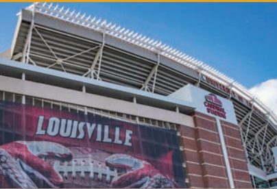
STADIUMS/RECREATION Cardinal Stadium