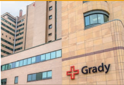
HEALTHCARE Grady Hospital